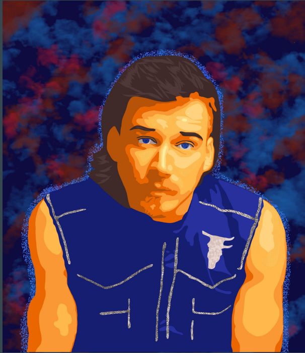
Digital Portrait of Morgan Wallen